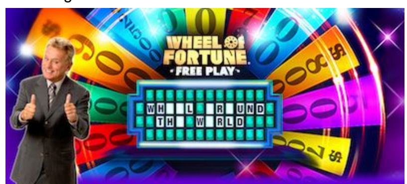
PS - Program #2?